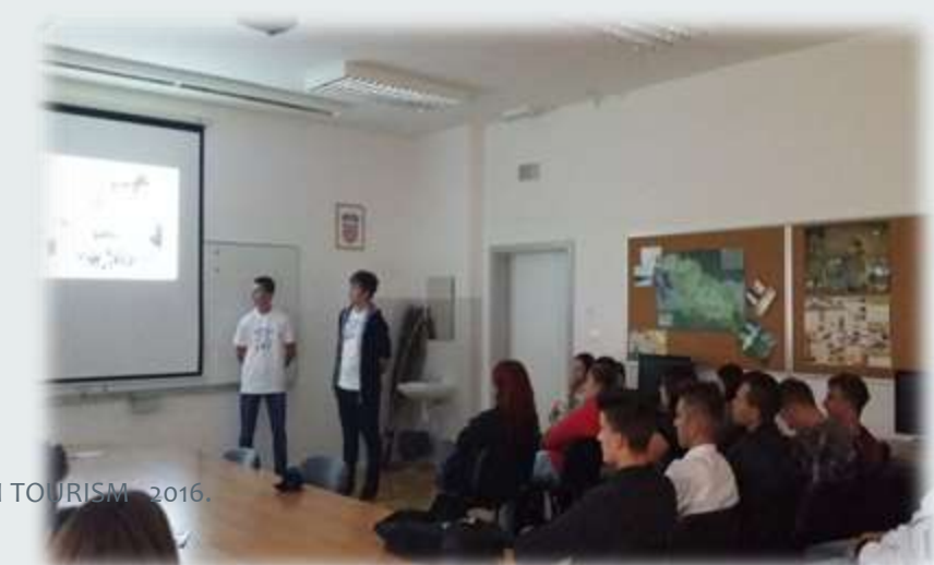
MINISTRY OF TOURISM