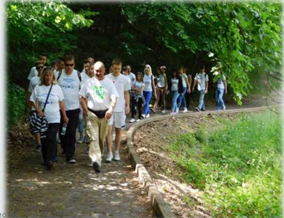
MINISTRY OF TOURISM