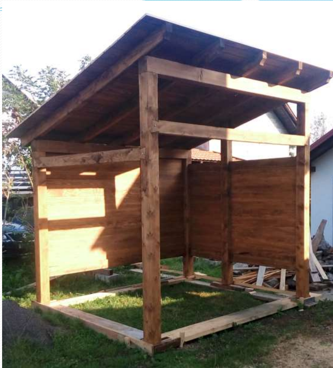
Bike-station in construction