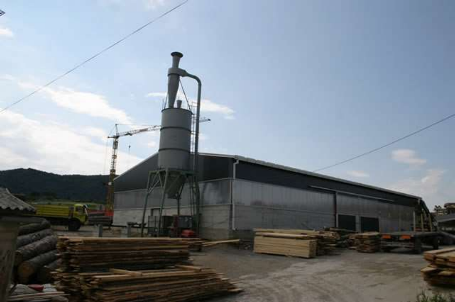
Getting the building material