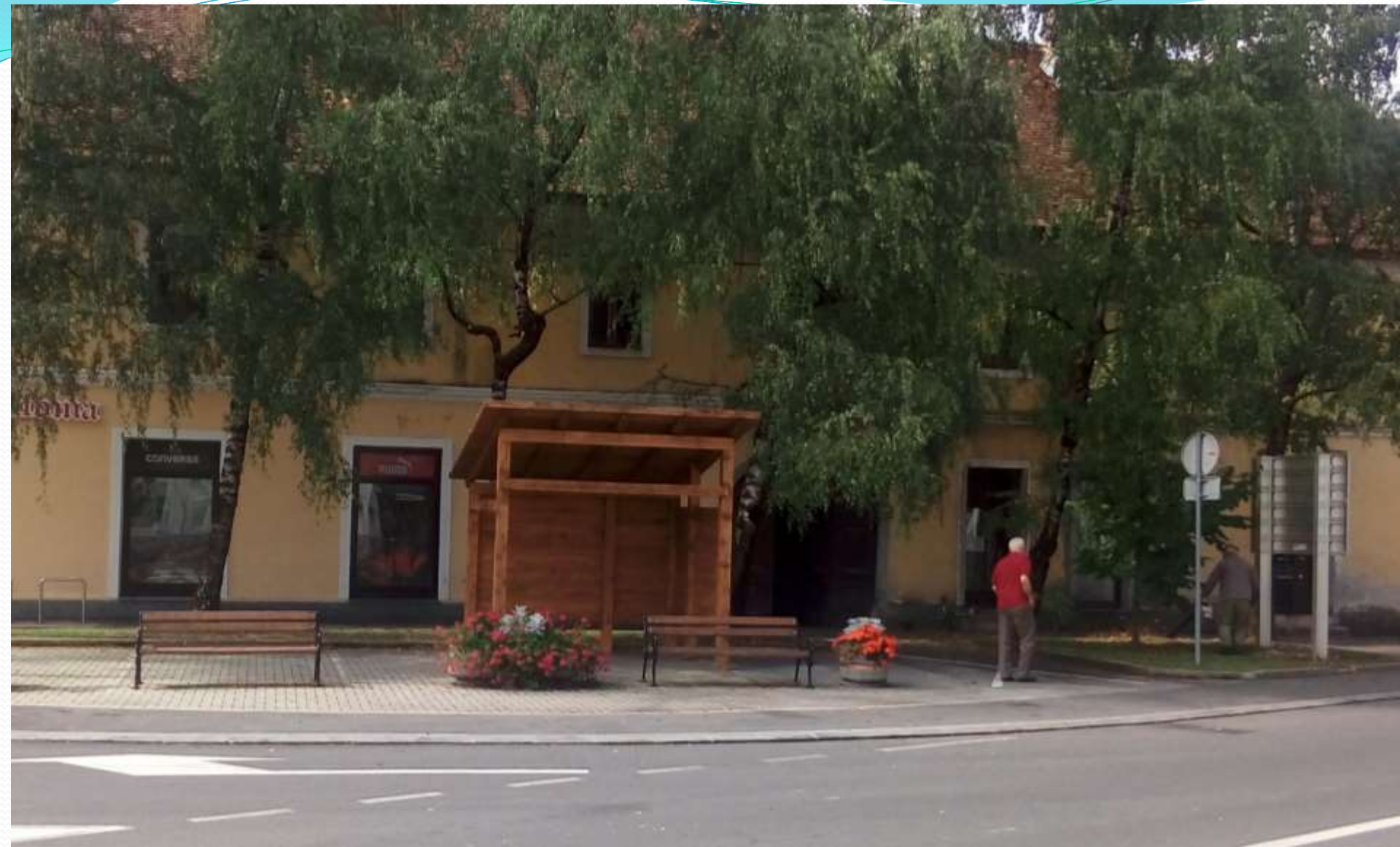
Bike-station on location