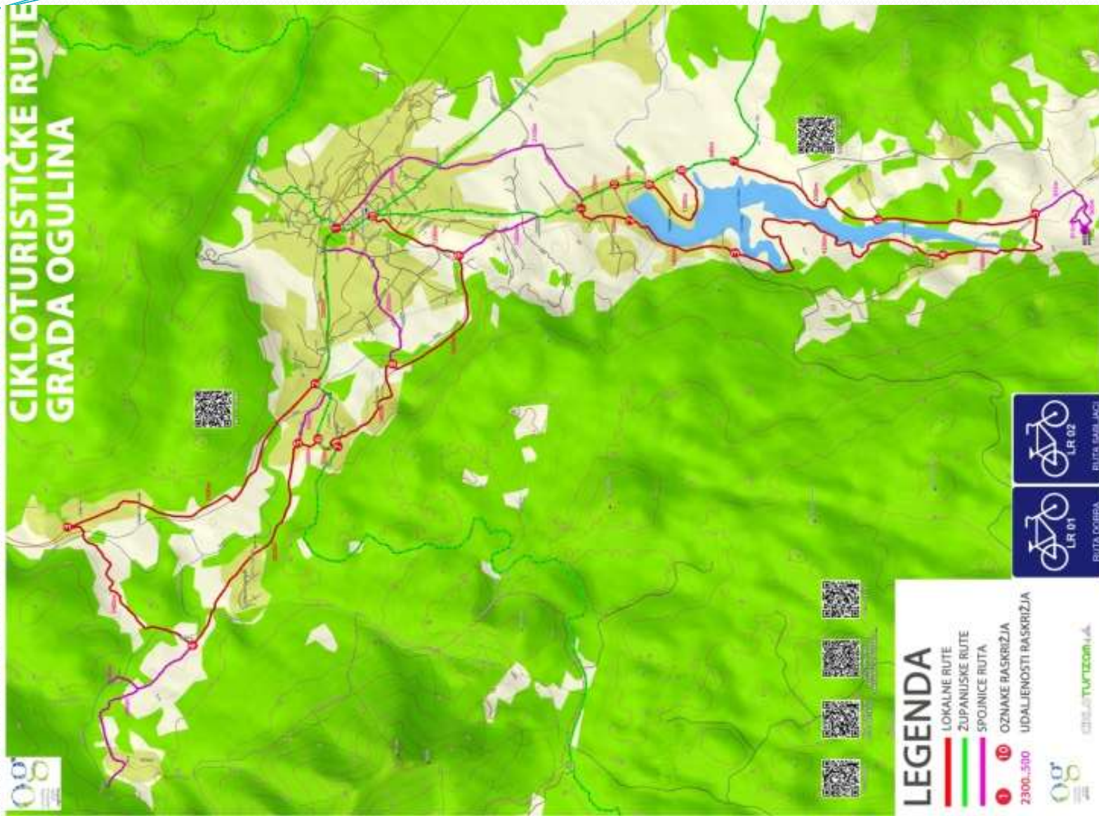
Map of cycle-friendly routes in Ogulin