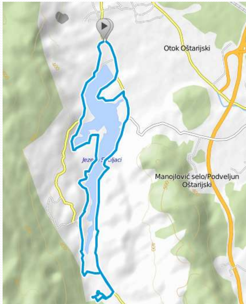
Local route Sabljaci