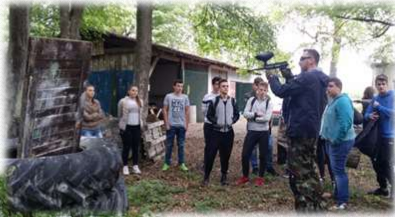
Paintball club „Mrlja”